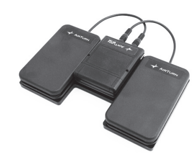
Hands-Free Page Turner