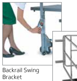
Backrail Swing Bracket