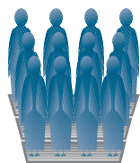
The 6' x 18" (1829 x 457 mm) Tourmaster accommodates 12 - 16 choir members.

* First number indicates how many performers will fit on a riser set if all performers stand shoulder to shoulder. Second number indicates how many performers will fit on a riser set if they are all facing center with shoulders overlapping. Numbers include a row of performers standing on the floor. Adult groups should use the lower capacity number.