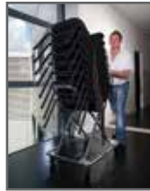
Move & Store Cart