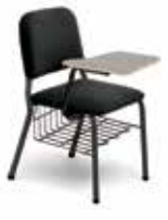
Folding Tablet Arm and Book/Music Storage Rack