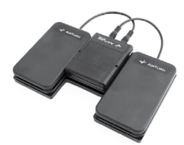
Hands-Free Page Turner